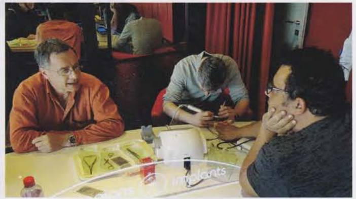
Figure 5: Delegates learning during the course