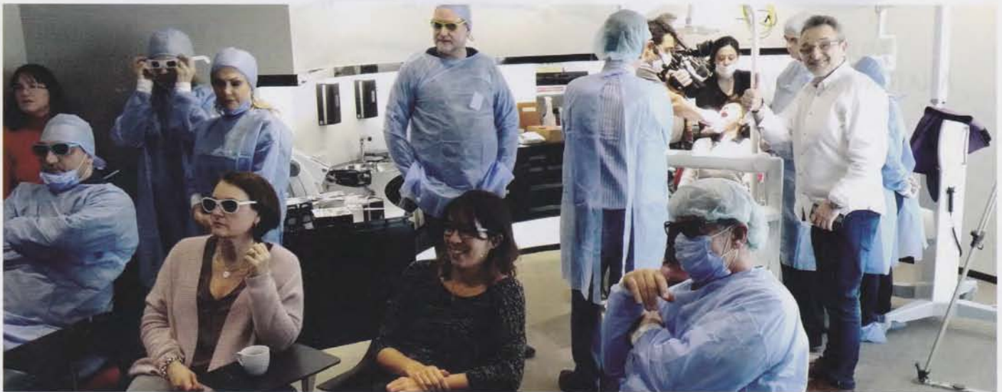
Figure 6: Learning on site

With the \varnothing 2.4mm – Condenser, the condensation is performed for the whole implant working length +2mm. While leaving the Condenser, you start with the preparation. By means of the Angle Modulator, the three layers (vestibular lamella, periosteum, and attached gingiva) are mobilized vestibularly.