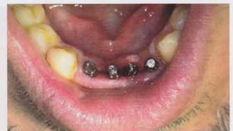
Figure 3: Four One Piece-Implants in place

The MIMI® flapless method is based on modern, bone physiological knowledge: bone quite accepts compression, or even needs 'bone training' – other orthopaedic surgical specialists realised this years ago. Without flap reflection of the gums and any damage of the periosteum, a small-sized, slightly conical drill is transgingivally drilled, and a slightly conical implant with a larger diameter is 'condensed' inside with controlled force.