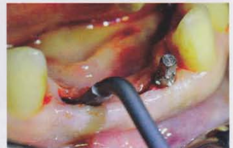
Figure 2: Making implant treatment predictable