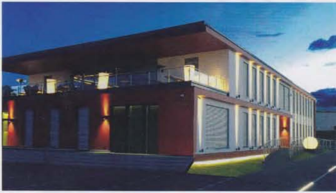
Figure 4: Champions HQ